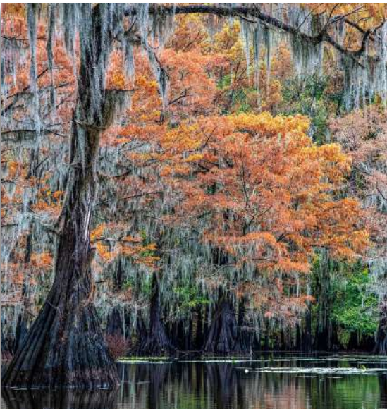
"Cypress Trees, Caddo Lake, Texas" Bill Shewchuk