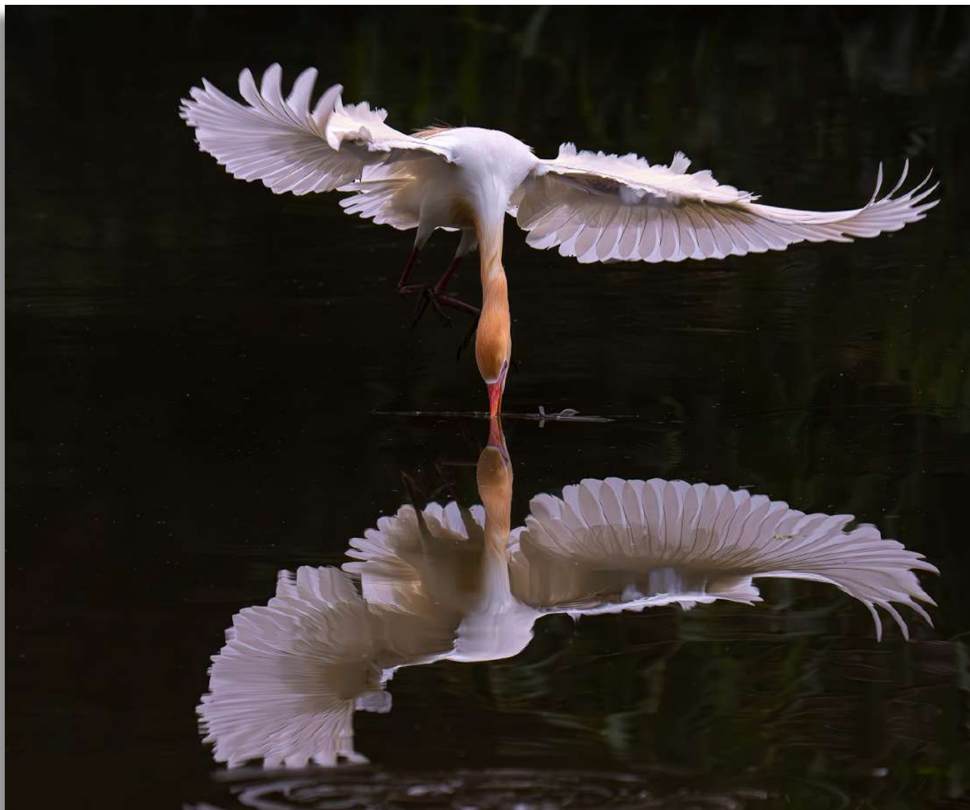
2024 Image of the Year - "Picking Up Sticks" by Julie Chen