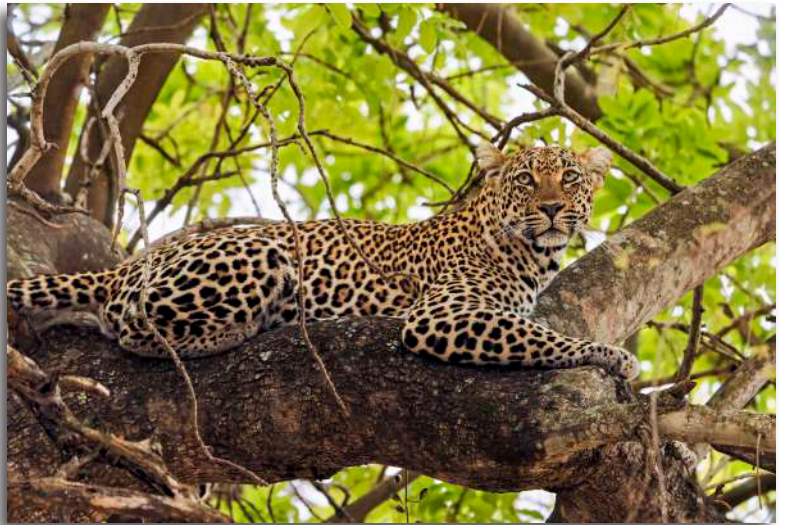
2 nd "Big Leopard in a Tree at Sabi Sands near Kruger South Africa" Rick Thau