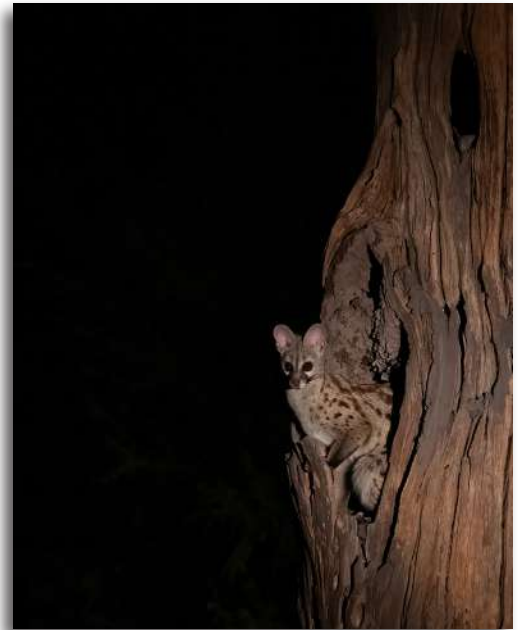
3 rd "South African small-spotted Genet inside Tree Burrow" Karen Schofield