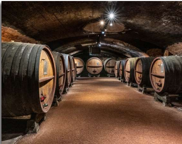
3 rd "Beaujolais Wine Cave" Dick Light