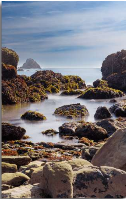
3 rd "Weston Beach, Point Lobos" Sara A Courtneidge