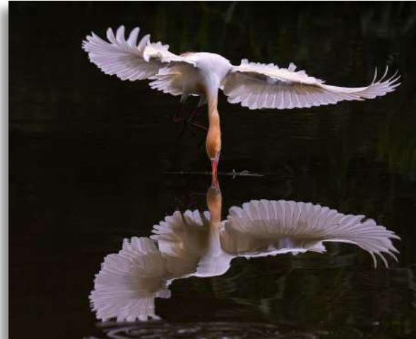
“Picking Up Sticks” Julie Chen