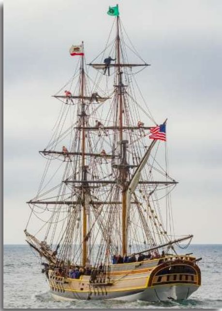
HM "Putting to Sea" Rick Verbanec