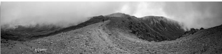
"Hiking Into the Storm" Joni Zabala