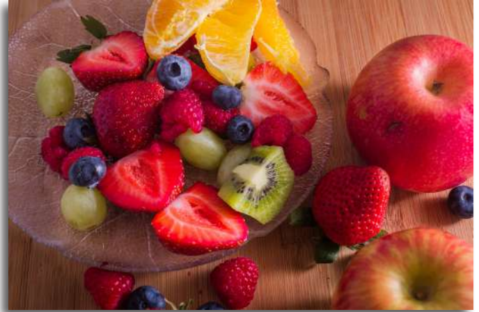
HM "Cut Up Fruit" Brian Spiegel