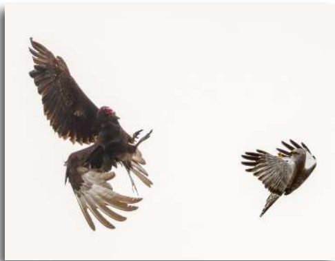
"Turkey Vulture and Northern Harrier Mixing it Up" Sara Courtneidge