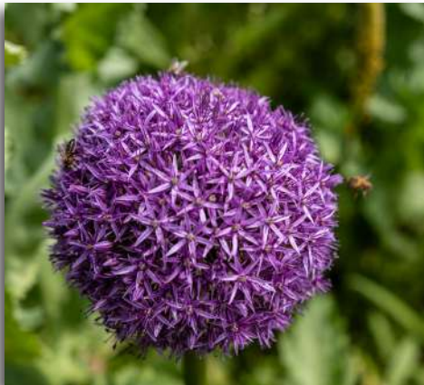
HM "Alium Globemaster" Dick Light