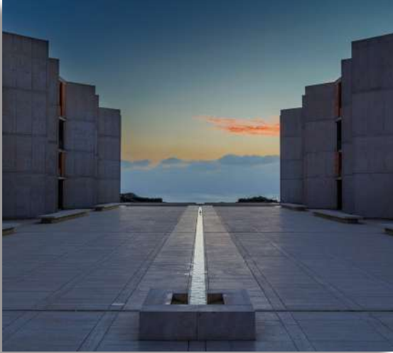
"The Salk Institute, La Jolla" Sara Courtneidge