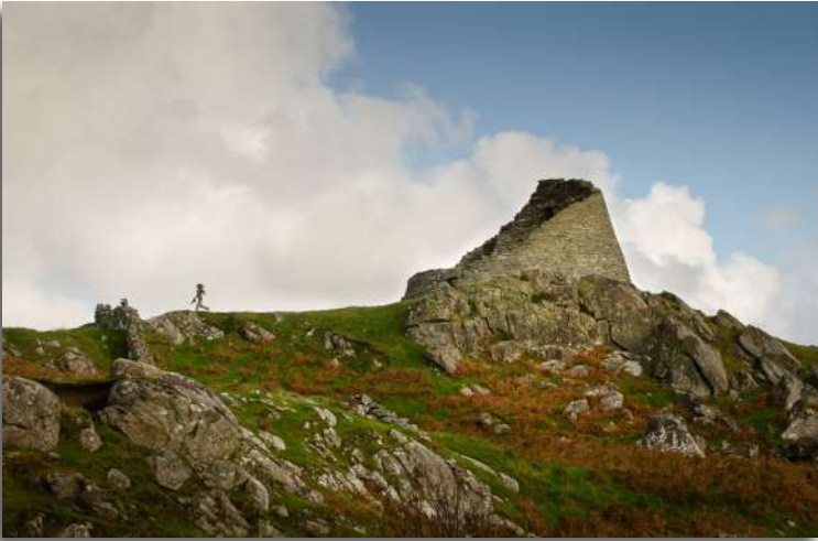
1 st "Running from the Broch" Jared Ikeda