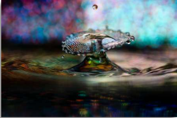
“Water Drop Sparkle” Brian Spiegel