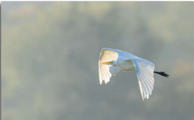
3 rd "Great Egret in Flight" Julie Chen