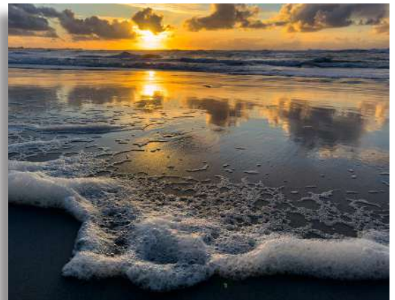
HM "Sunset at Asilomar" Carol Silveira