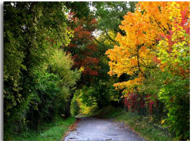
HM "Autumn Stroll" Don Eastman