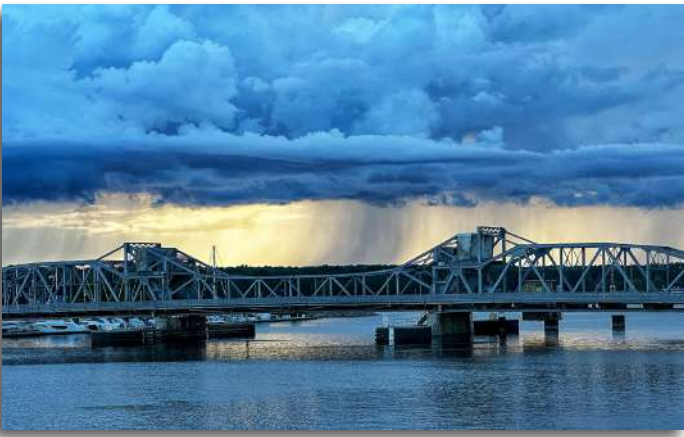
HM "The Old Steel Bridge" Bill Shewchuk