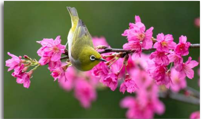
HM "Japanese White-eye in Plum flowers" Julie Chen