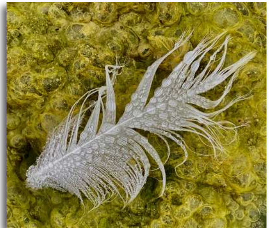
HM "Gull Feather in Gut Weed" Sandie McCafferty