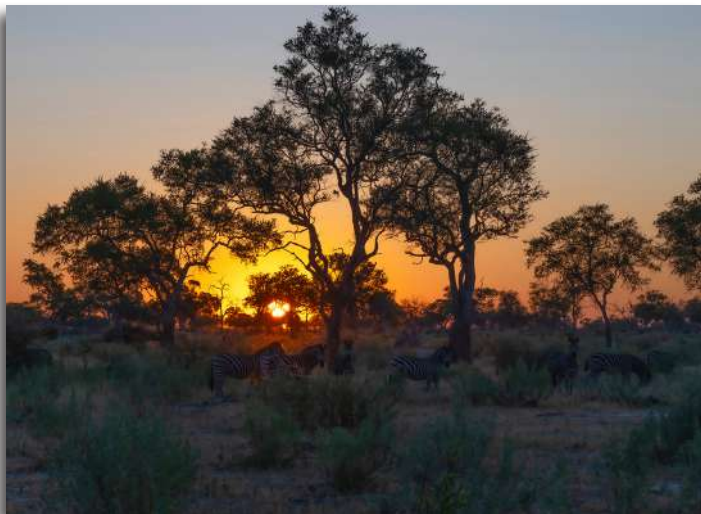
3 rd "Colors of the Botswana Sunset" Karen Schofield