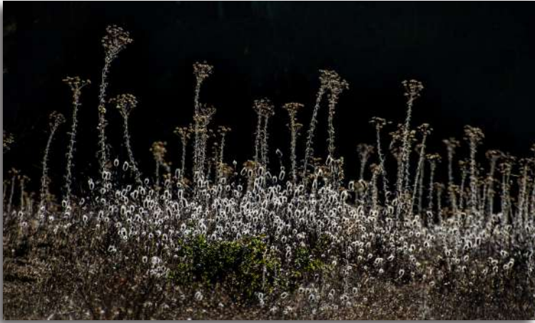
1 st "Ragweed at Fort Ord" Jared Ikeda