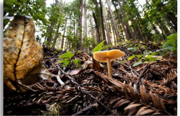
"Mushroom Caught in Light" Brian Spiegel