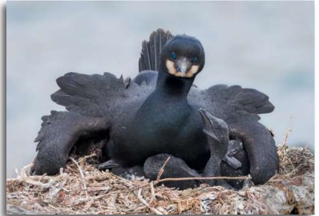
HM "Brandt's Cormorant" Sara A Courneidge