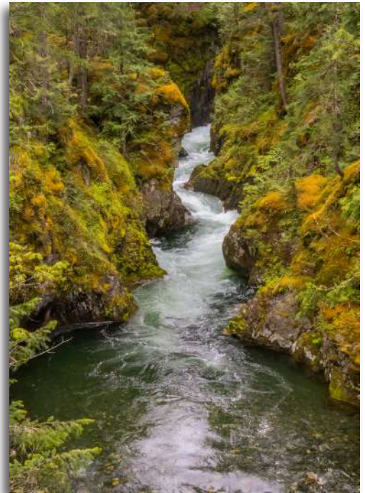
3 rd "River Slalom to Little Qualicum Falls" Rick Verbanec