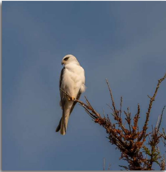
2 nd "White Tailed Kite" Dick Light