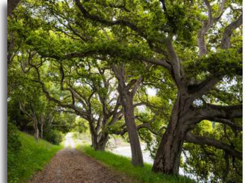
"Oak Tunnel" Sara Courtneidge