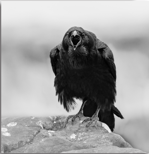
2 nd "Common Raven" Sara A Courneidge