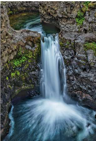
“Icelandic Waterfall” Bill Sherwchuk